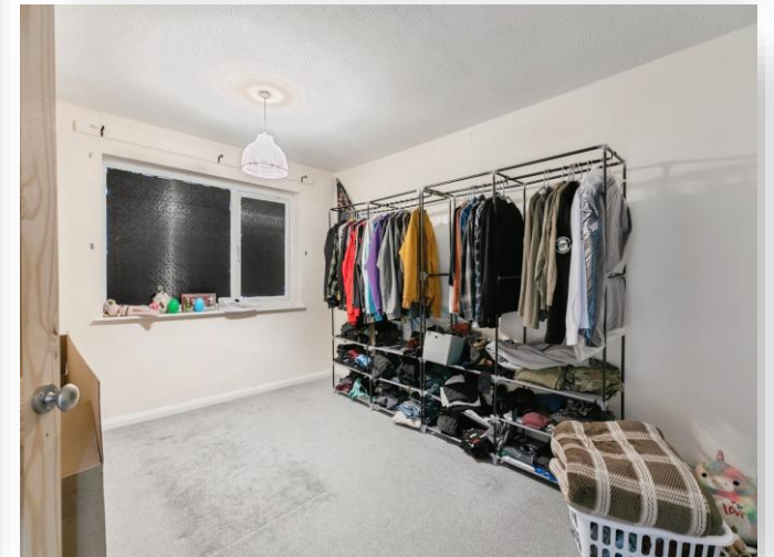
Tithe Avenue, Beck Row IP28 8BZ