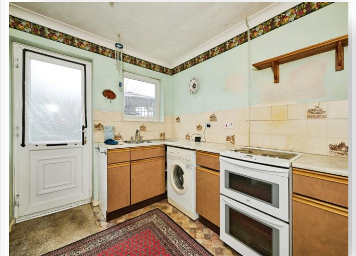
Winston Way, Farcet Peterborough PE7 3BU