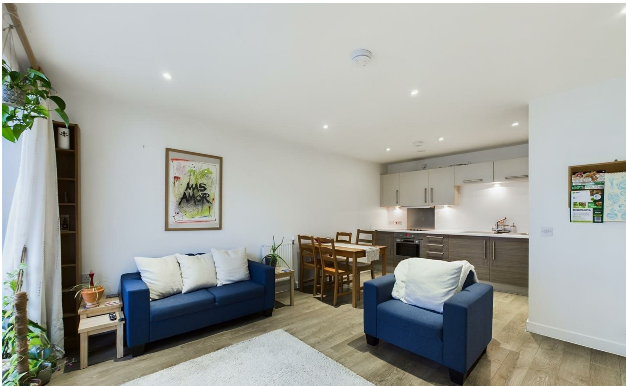
510, Casson Apartments 43 Upper North Street, New Festival Quarter, Canary Wharf, London, E14 6FY £397,500