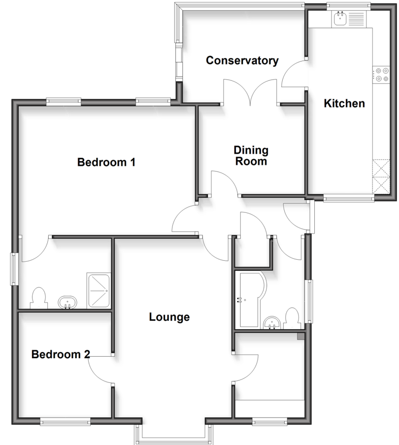
Ground Floor Approx. 96.8 sq. metres (1042.4 sq. feet)

Call Snodland - 01634 245055 ■ wardsof Kent.co.uk