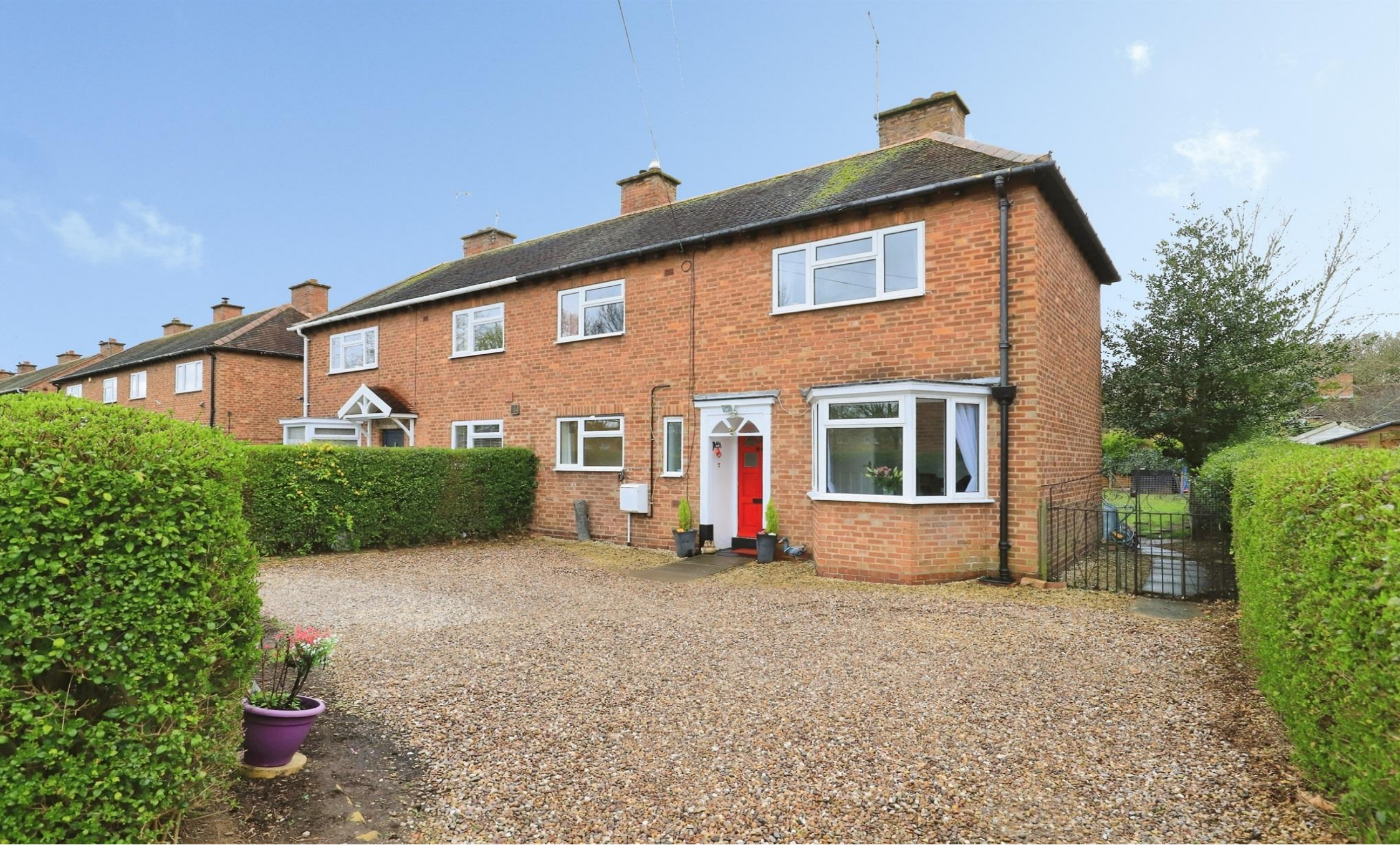
Erneley Close, Stourport-On-Severn DY13 0AH