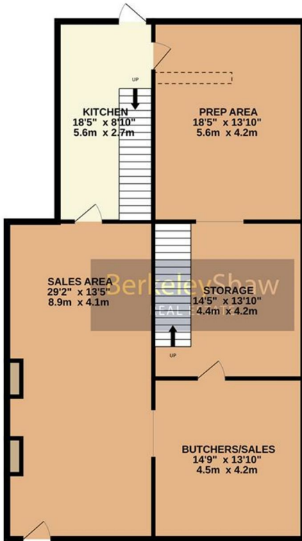
GROUND FLOOR 1210 sq.ft. (112.4 sq.m.) approx.