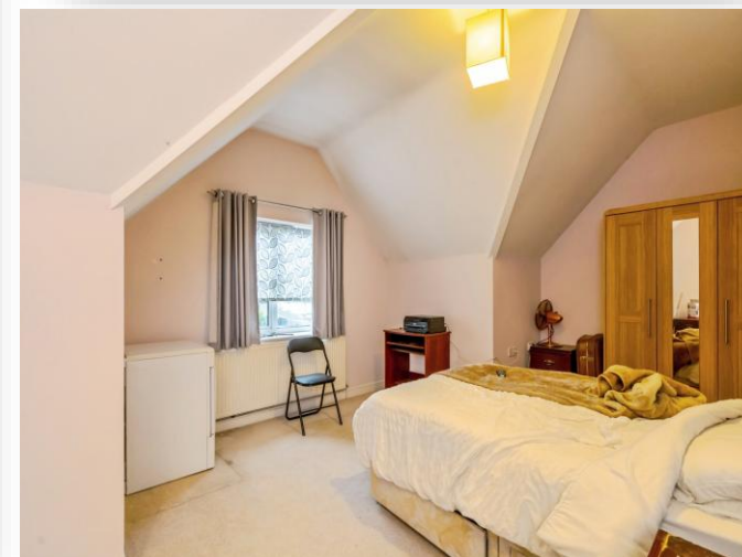
Magnolia Court Victoria Drive, Bognor Regis PO21 2ED