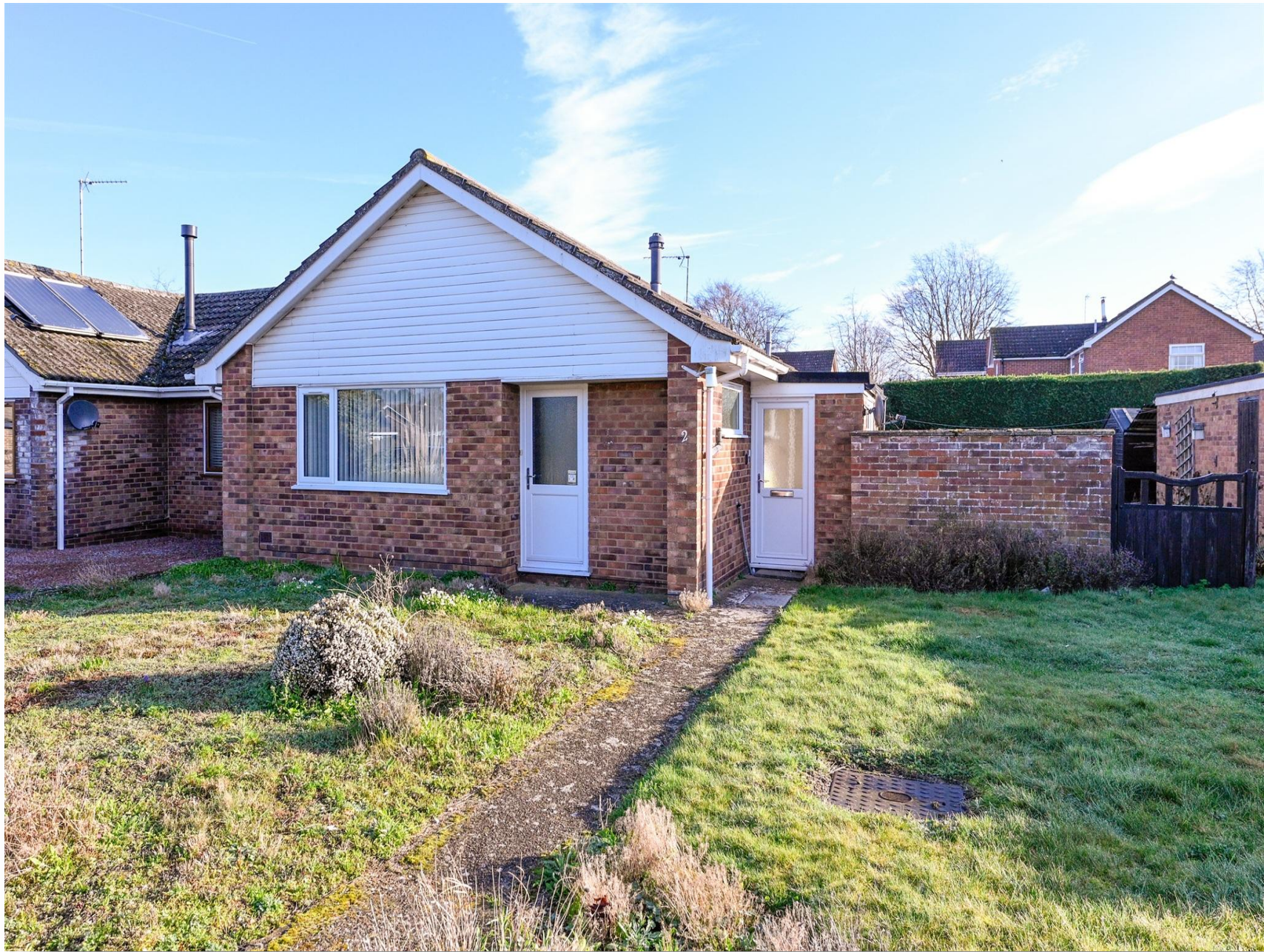
Nursery Close, Grimston, King's Lynn, PE32 1DH