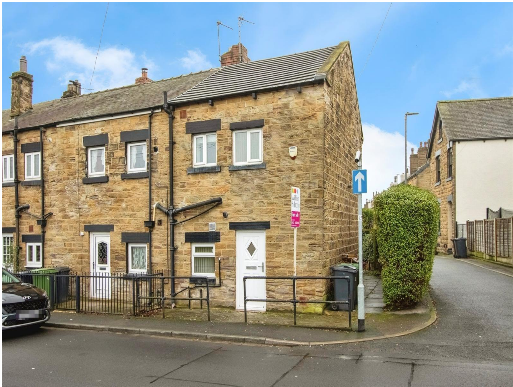
Copley Lane, Robin Hood Wakefield WF3 3AA