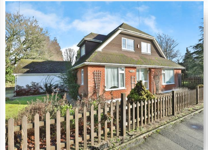
Christchurch Road, West Parley Ferndown BH22 8SH