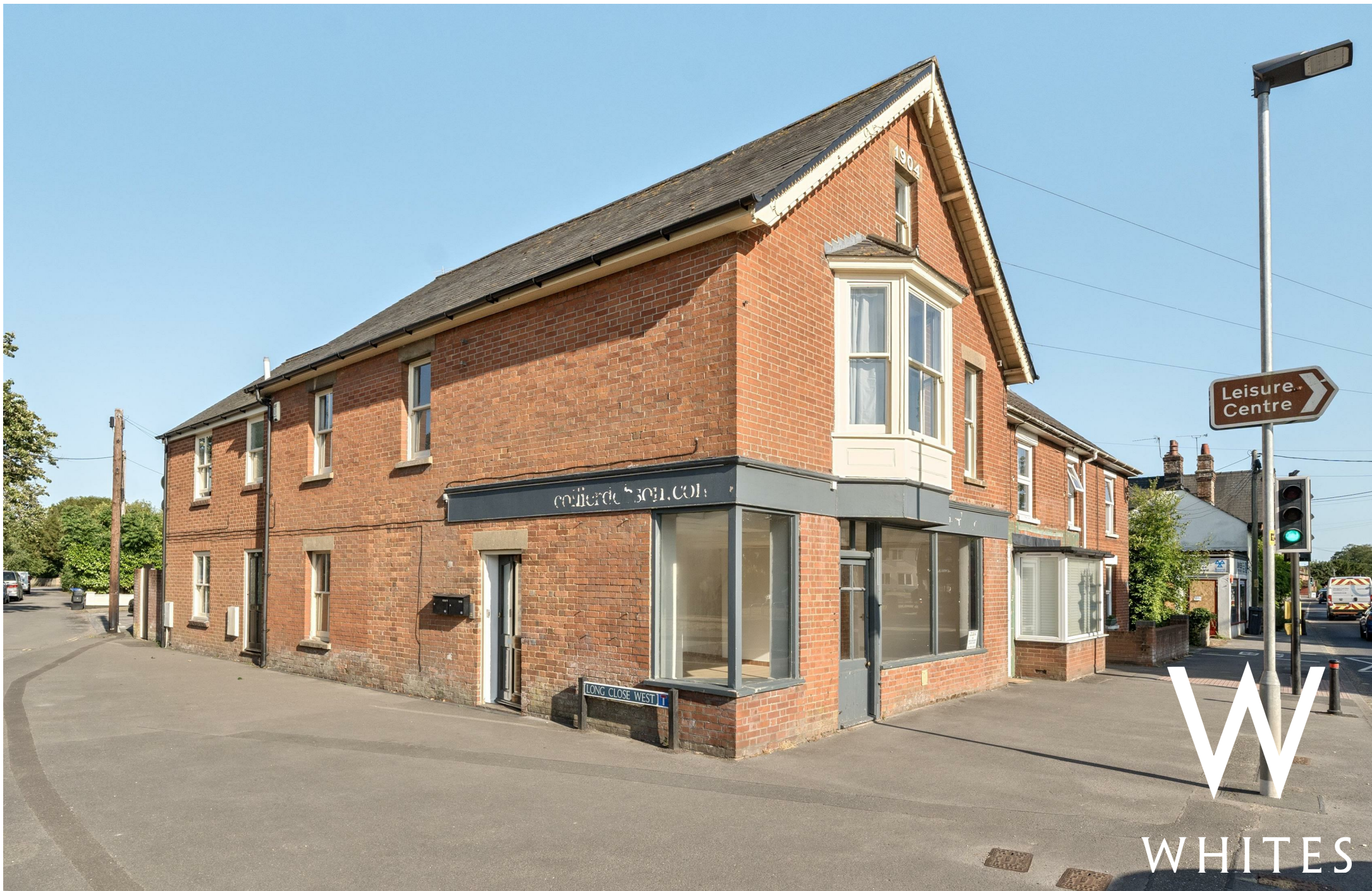
Flat 2, Long View Long Close, Downton, Wiltshire, SP5 3HX