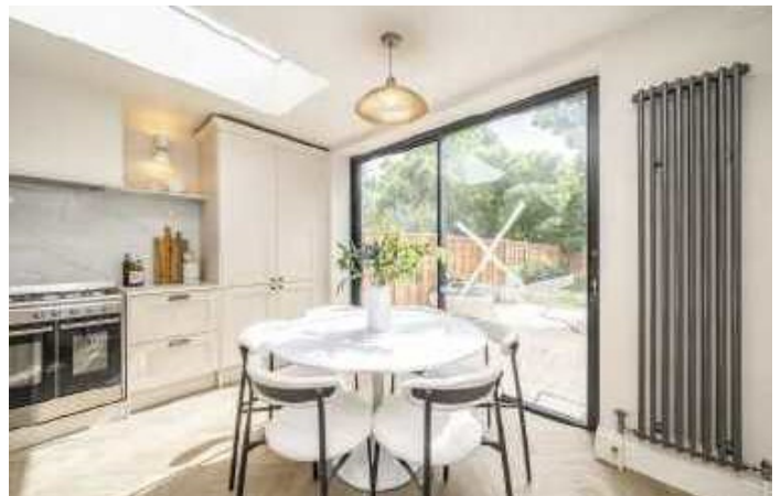
Enfield Road, TW8