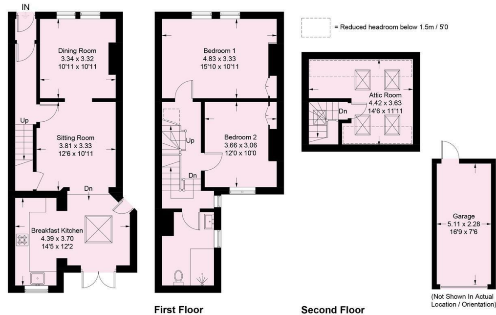
illustration for identification purposes only, measurements are approximate, not to scale Pursuant to RICS Property Measurement 2nd Edition © Intelligent Property Marketing 2026