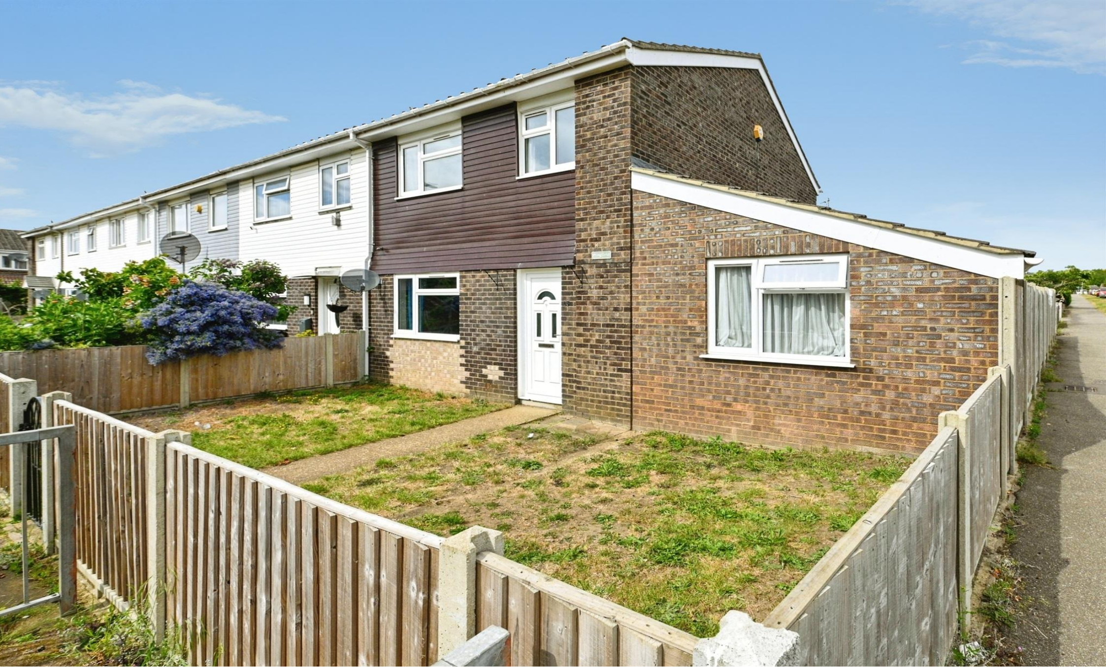
Wingfield, King's Lynn, PE30 4XG