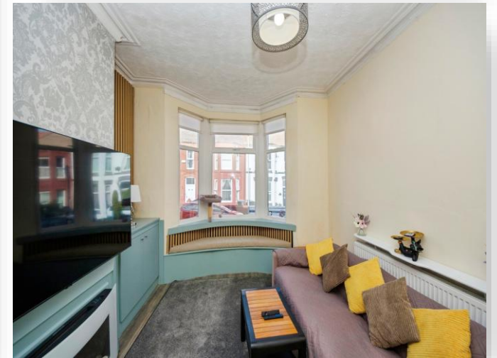
Wright Street, Wallasey, CH44 8BD