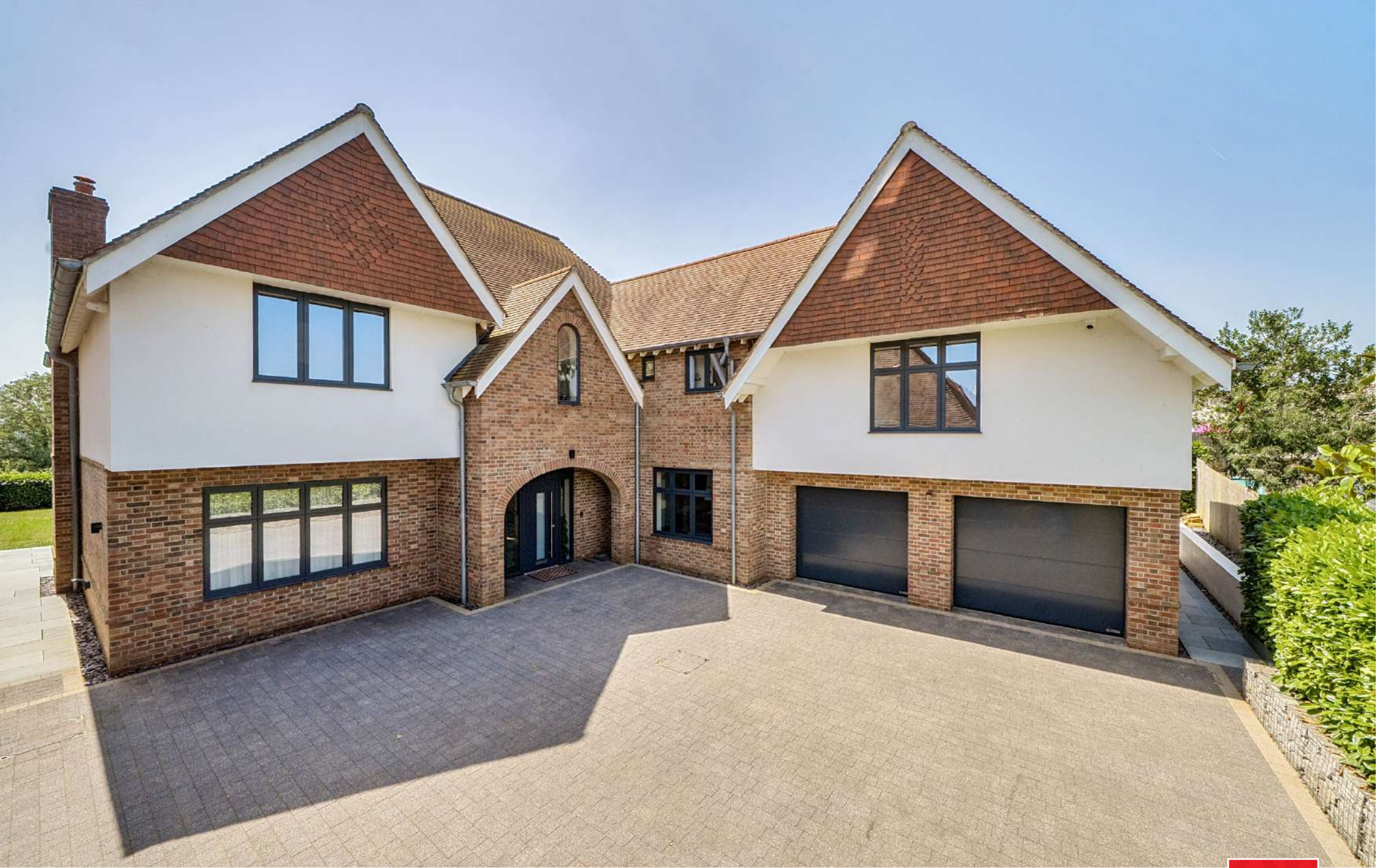
Highview, The Views Taunton TA1 5JB