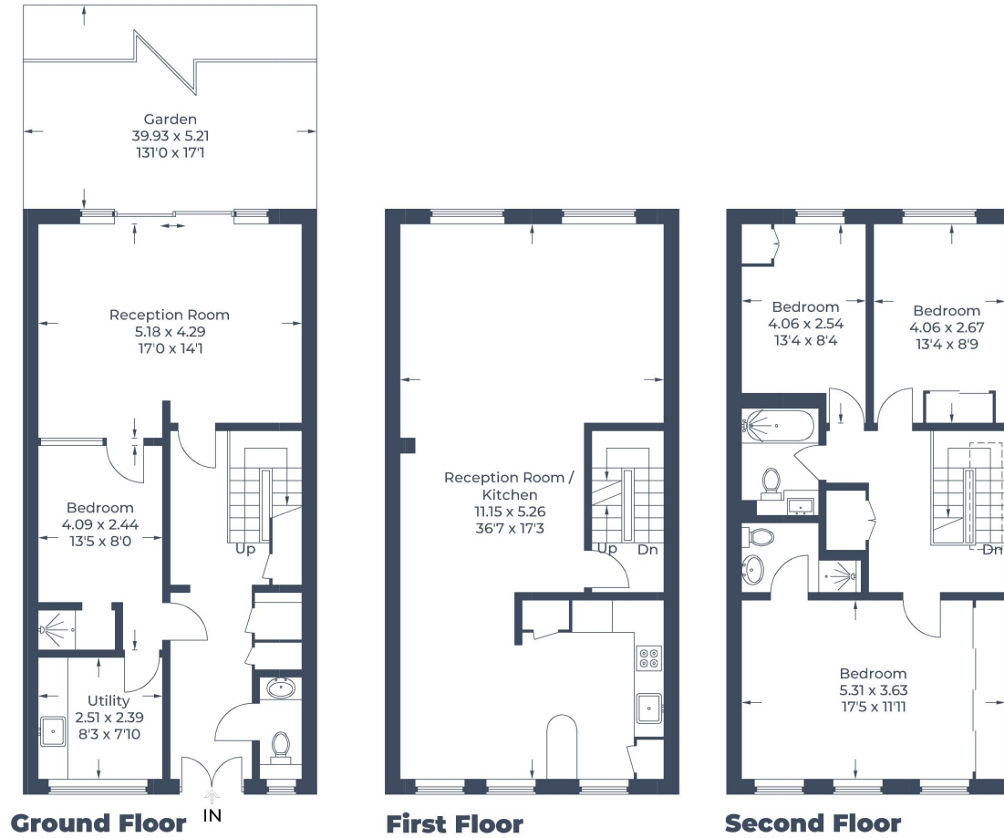
Illustration for identification purposes only, measurements are approximate, not to scale. © CJ Property Marketing Produced for Robsons