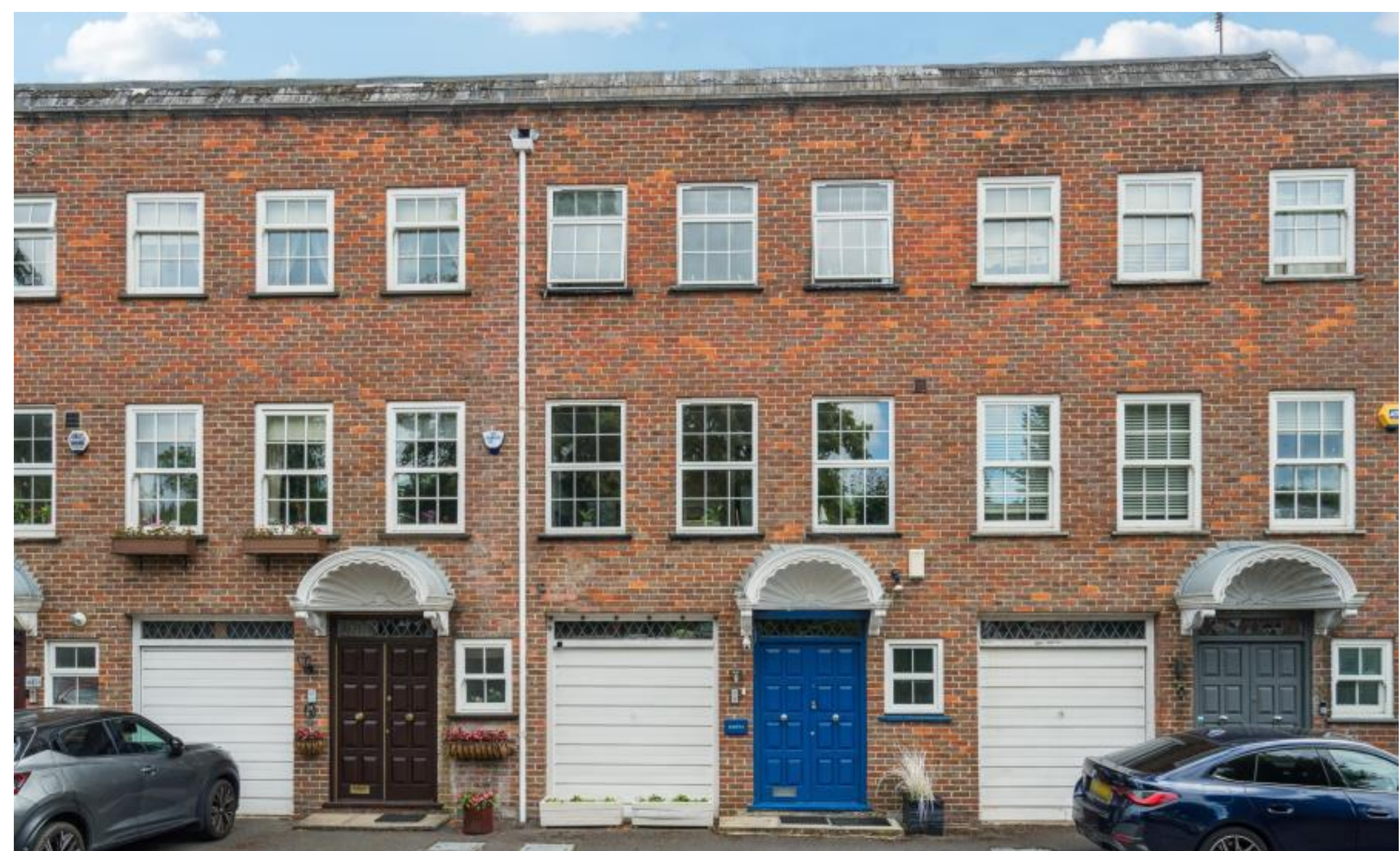
A four bedroom town house in a central location Dene Road, Northwood, HA6 2AA