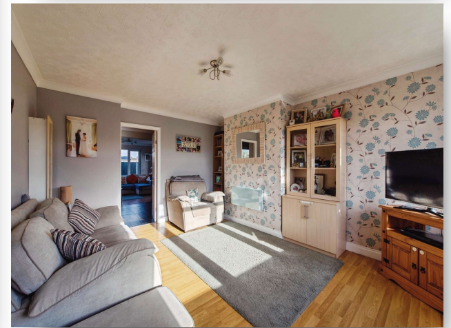
St. Michaels Close, Billingham Lincoln LN4 4EZ