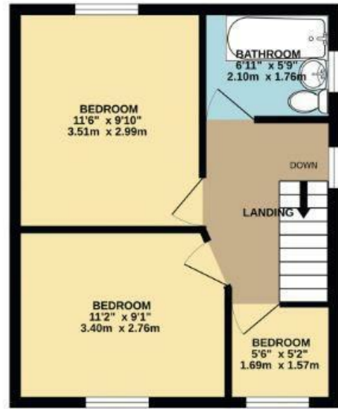
1ST FLOOR 344 sq.ft. (31.9 sq.m.) approx.