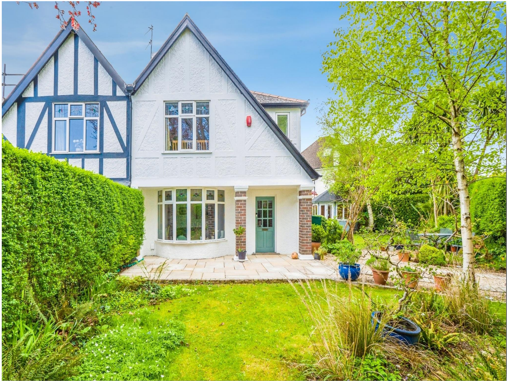
Highfields, Cardiff CF5 2QB