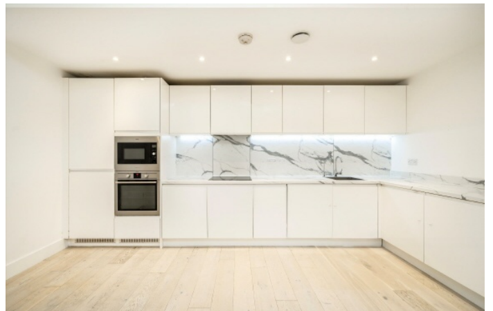
Frazer Nash Close, TW7