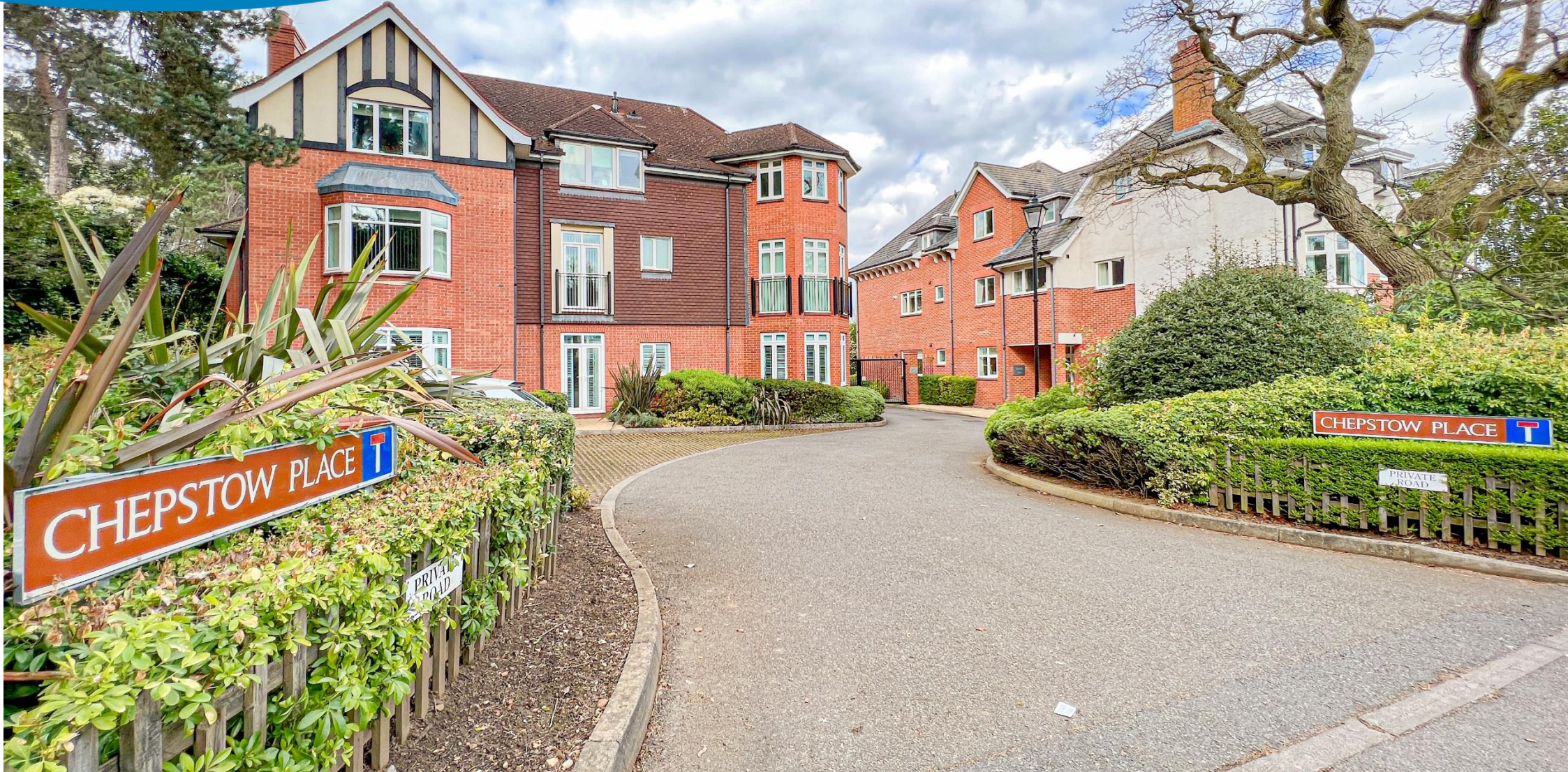
Burghley House, Chepstow Place, Streetly Sutton Coldfield, B74 3TN