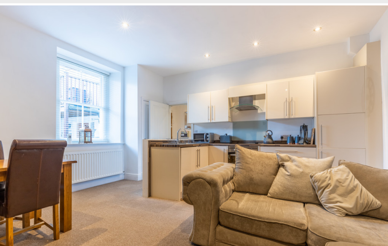
Open plan Kitchen/Living Room