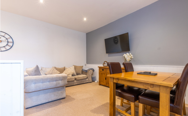
Open plan Living space