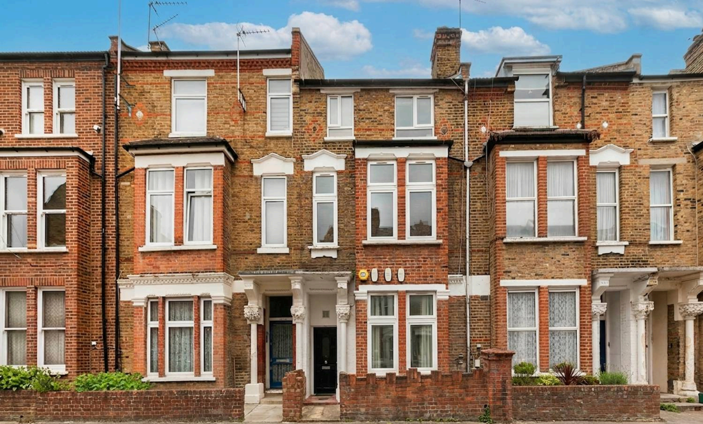
Charteris Road, Queens Park, NW6. £2,200 pcm