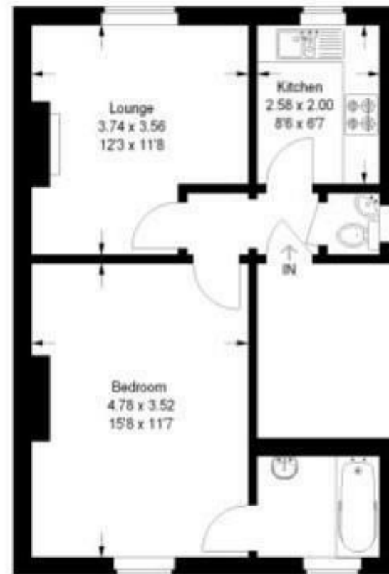
First Floor Flat

These plans are for representation purposes only as defined by RICS - Code of Measuring Practice. Not to Scale. (ID42888)