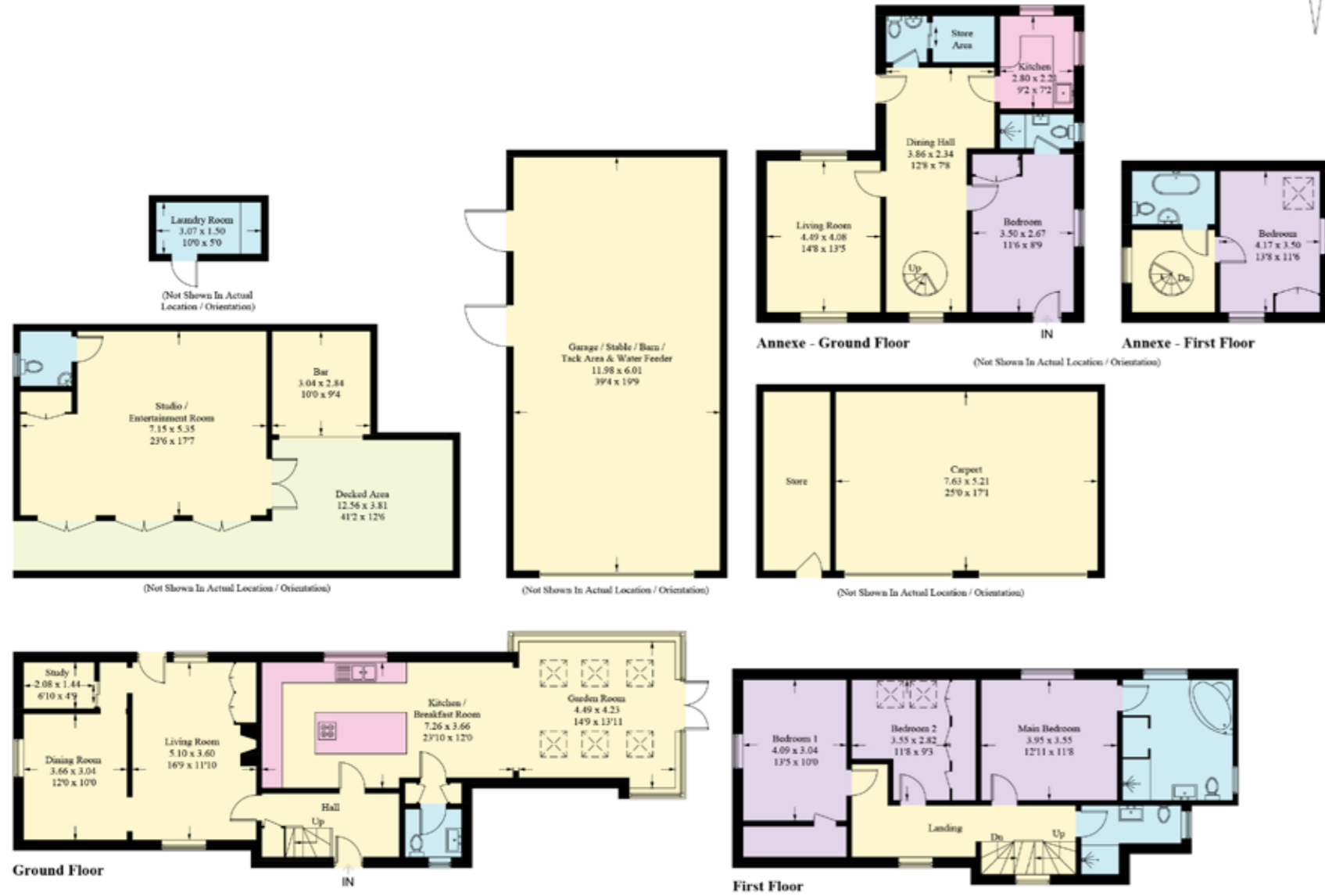
Illustration for identification purposes only, measurements are approximate, not to scale. Fourlabs.co © (ID1297788)