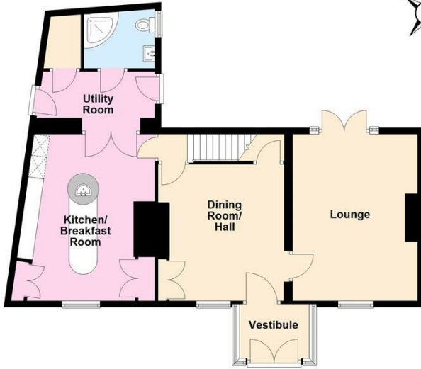
Ground Floor Approx. 85.6 sq. metres (921.0 sq. feet)