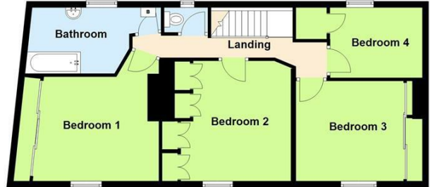
First Floor Approx. 72.0 sq. metres (775.3 sq. feet)

Total area: approx. 157.6 sq. metres (1696.3 sq. feet)