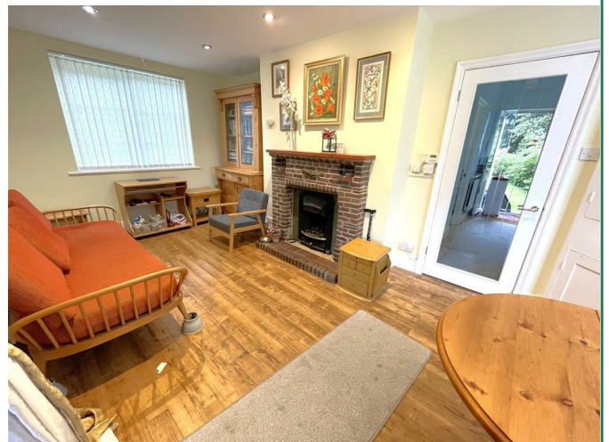
Pigeon Croft Emmetts Lane, Ide Hill, Sevenoaks, TN14 6BD Price Guide £750,000