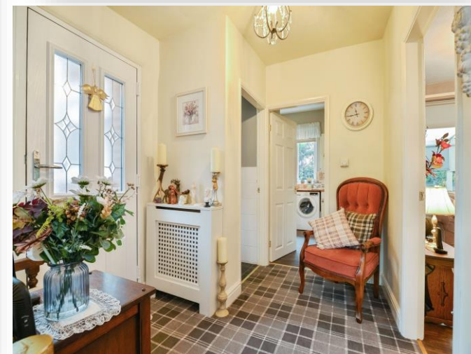
Logan Drive, Stockton-On-Tees TS19 7EG