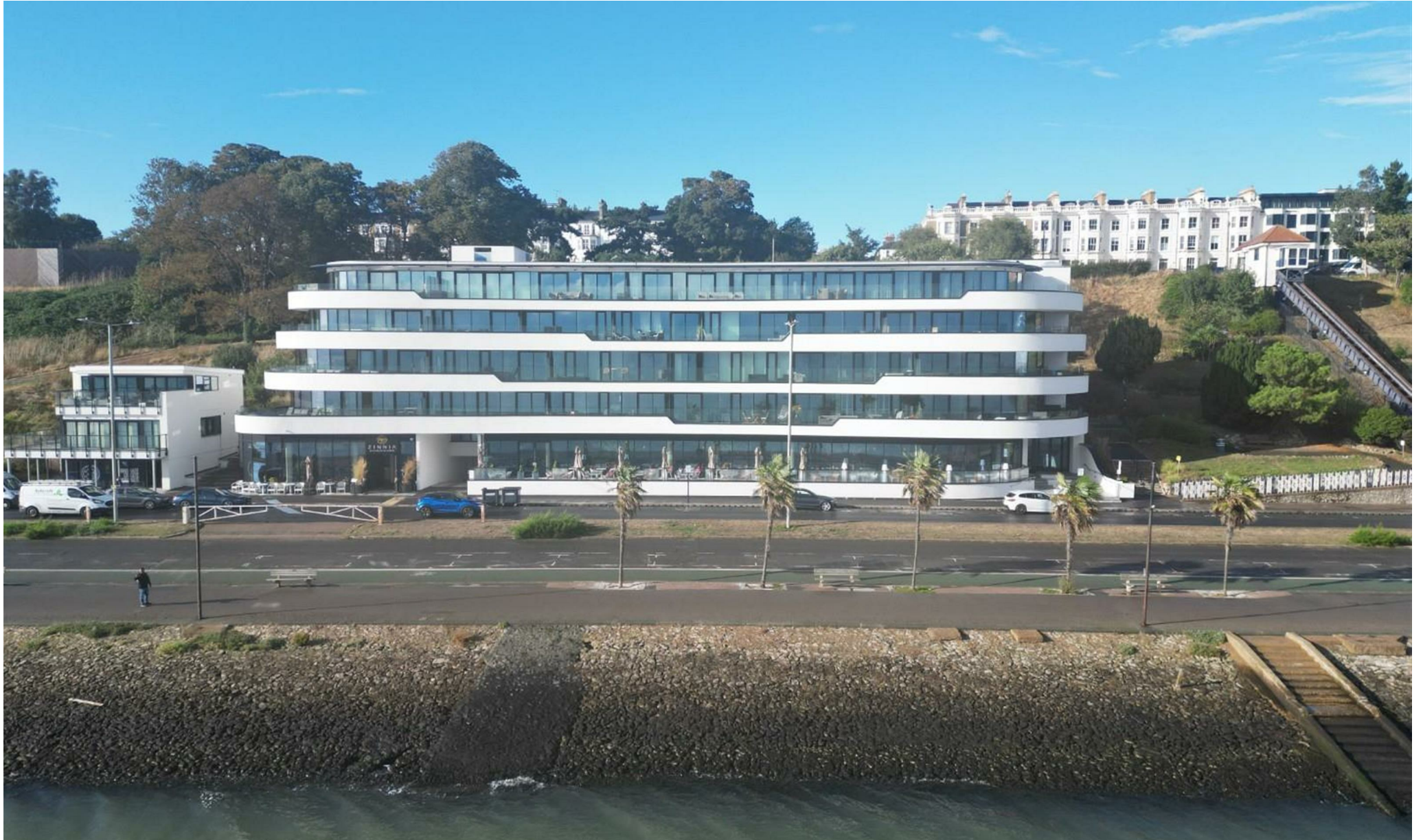
Clifftown Shore, Western Esplanade, £265,000