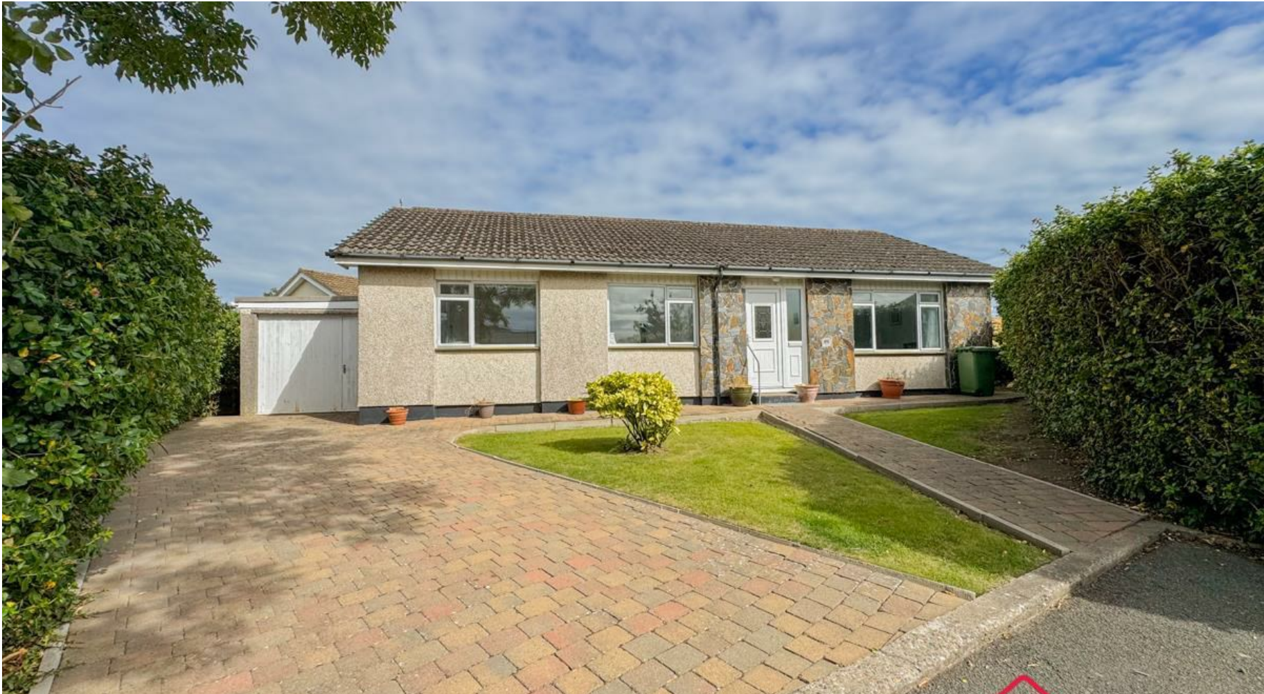
65 Lilac Grove, Ballasalla, Isle of Man, IM9 2DZ Asking Price £369,950