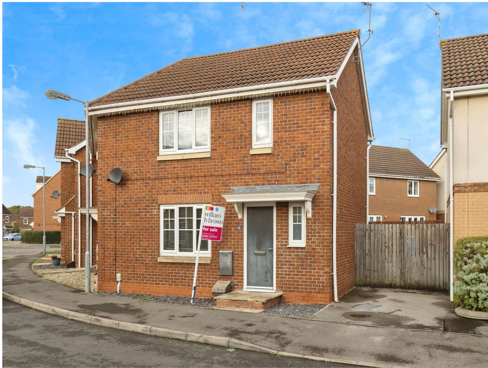
Pasture View, Kingswood, Hull, HU7 3AH