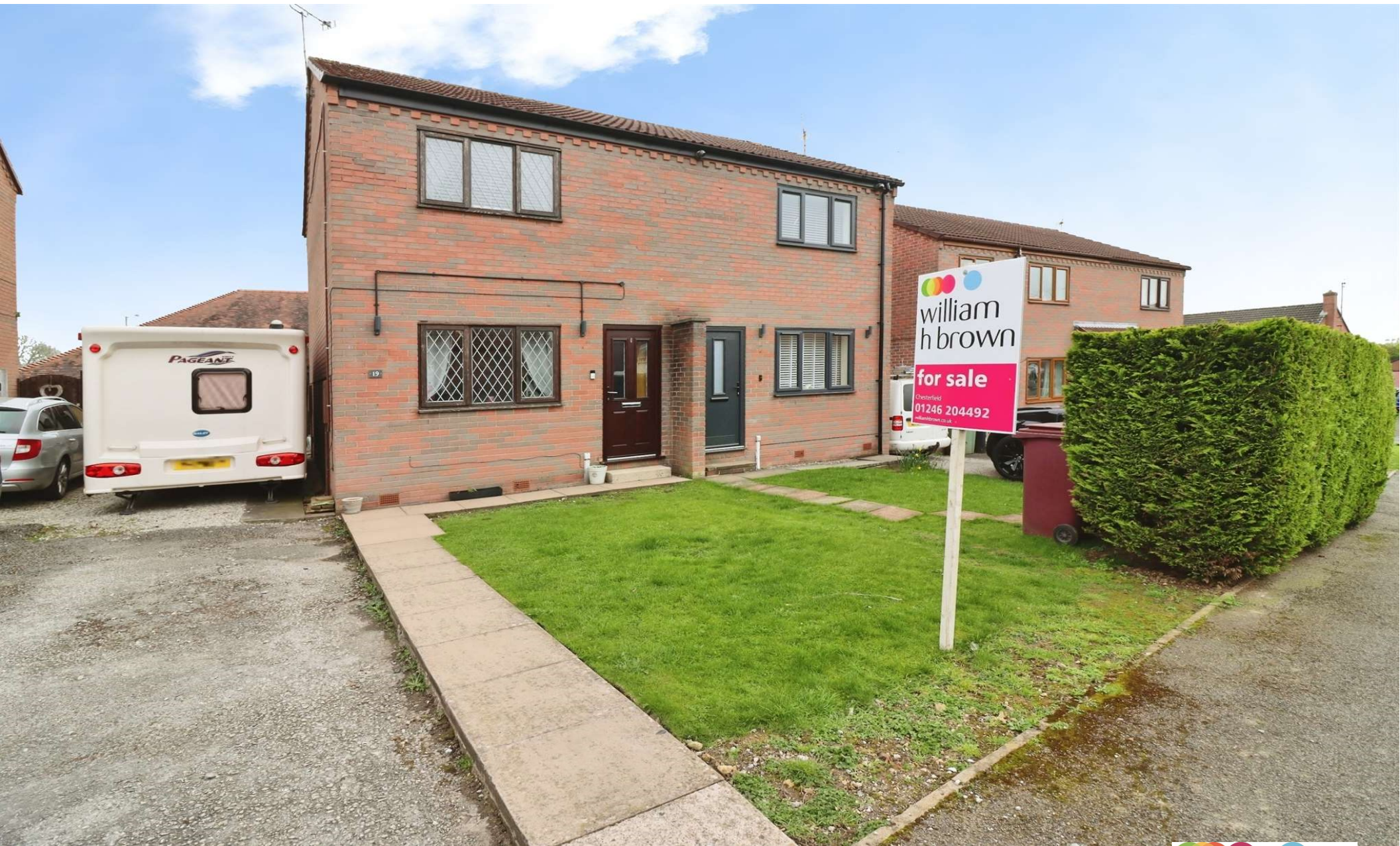
Severn Crescent, North Wingfield Chesterfield S42 5NY