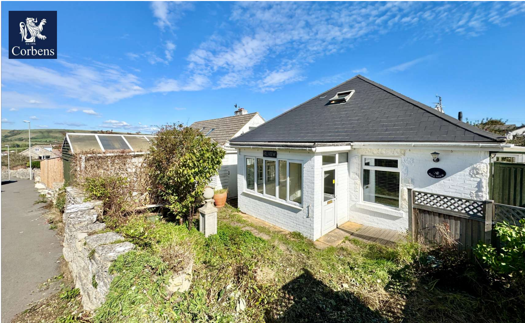
HILLVIEW, PANORAMA ROAD, SWANAGE £445,000 FREEHOLD