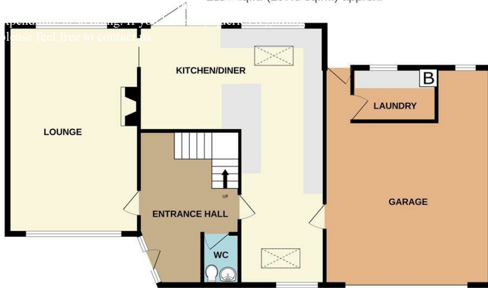
GROUND FLOOR 1154 sq.ft. (107.3 sq.m.) approx.