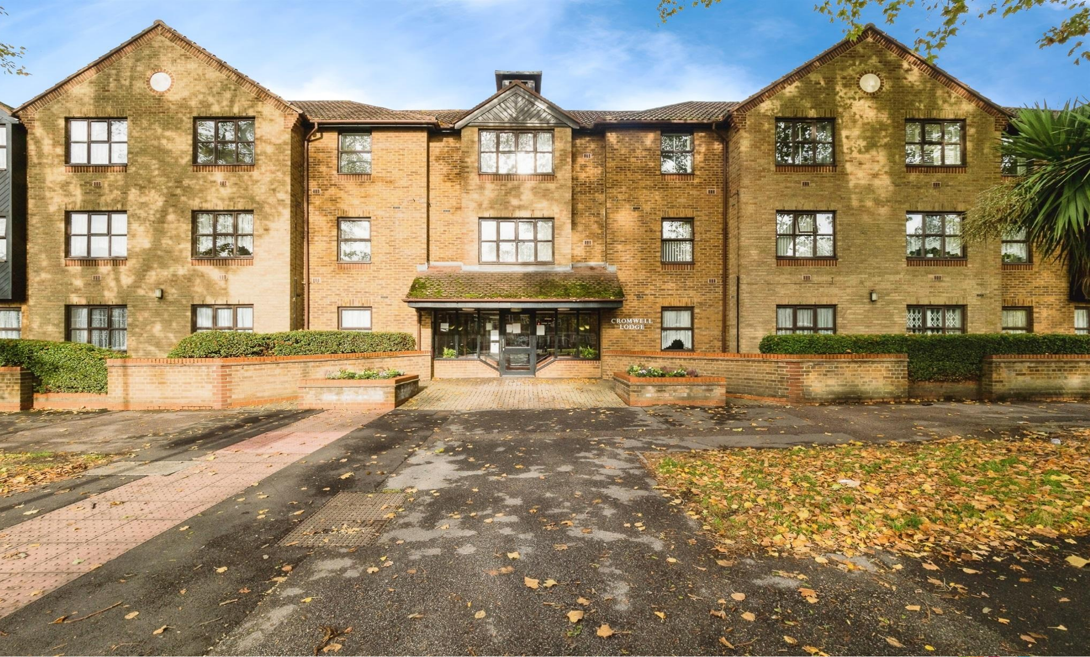
Cromwell Lodge, Longbridge Road, Barking, IG11 8UB