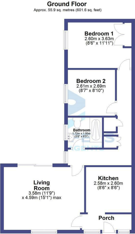
Total area: approx. 55.9 sq. metres (601.6 sq. feet) Not to scale. For illustration purposes only. Plan indicates property layout only. Plan produced using PlanUp.

These particulars, whilst believed to be accurate are set out as a general outline only for guidance and do not constitute any part of an offer or contract. Intending purchasers should not rely on them as statements of representation of fact, but must satisfy themselves by inspection or otherwise as to their accuracy. No person in this firms employment has the authority to make or give any representation or warranty in respect of the property.