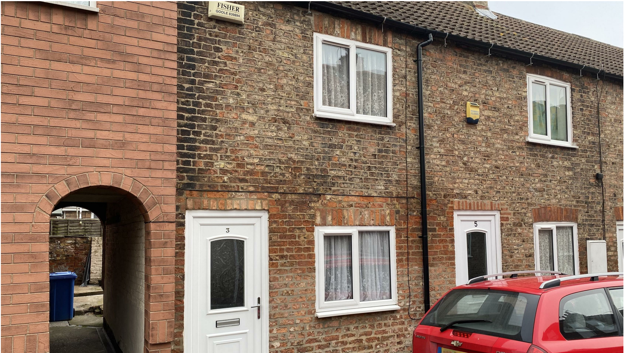
3, Common Piece, Swinefleet, Goole, DN14 8DE £550 PCM