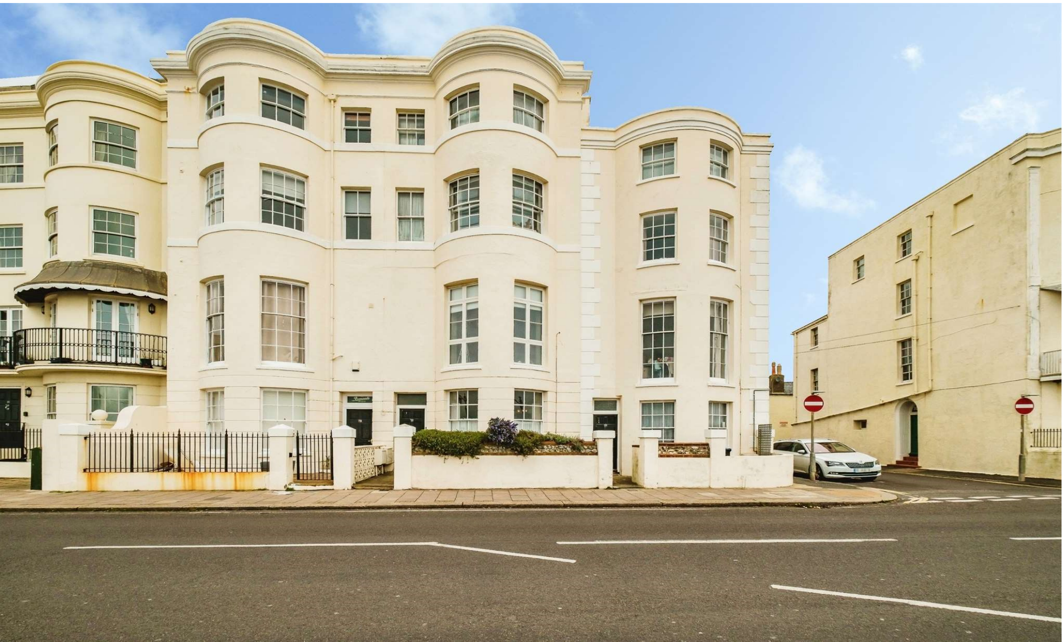
Ground Floor Flat Marine Parade, Worthing BN11 3QE