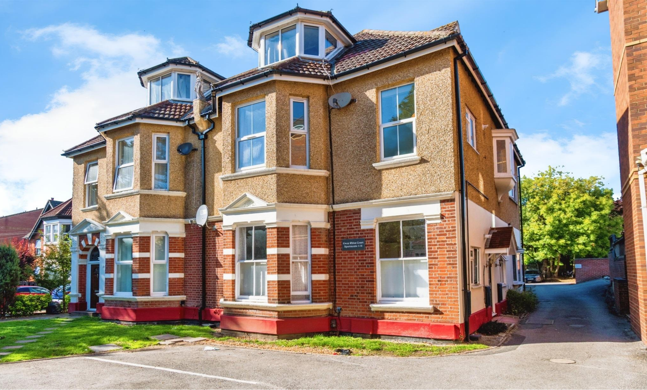
Gwen Rhian Court, Court Road, Southampton SO15 2JR