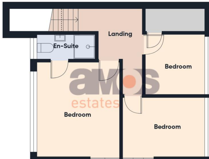
First Floor Building 1