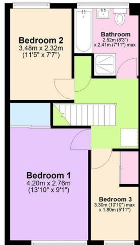
Floor plan is for illustrative purposes only. Plan produced using PlanUp.