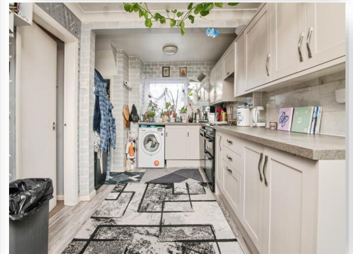
Oldacre Road, Oldbury B68 0RJ