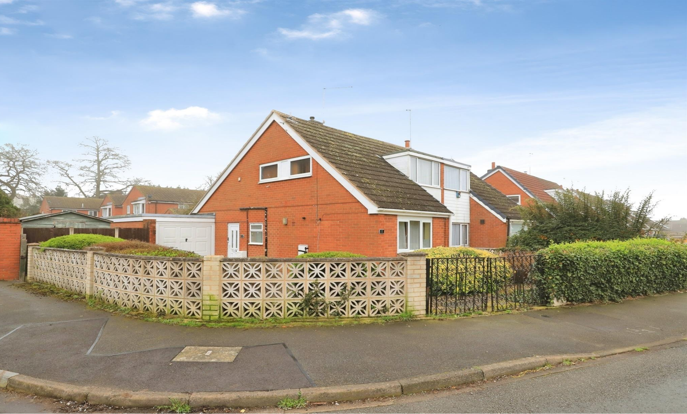
The Deansway, Kidderminster DY10 2RH