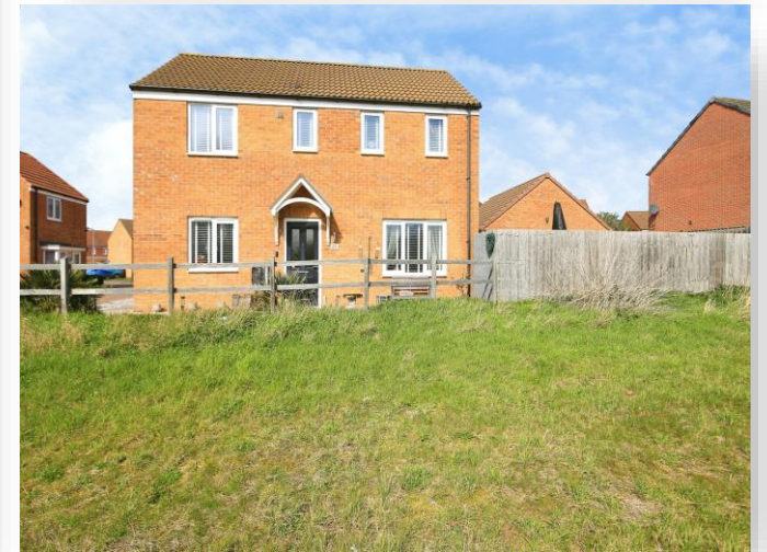
Linus Grove, Peterborough PE2 8FX