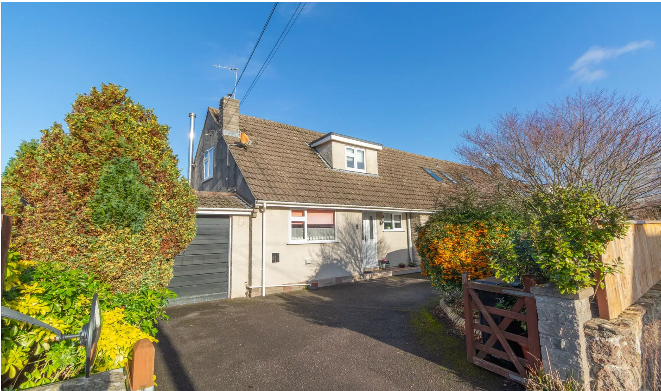
The Lynch, Winscombe £390,000