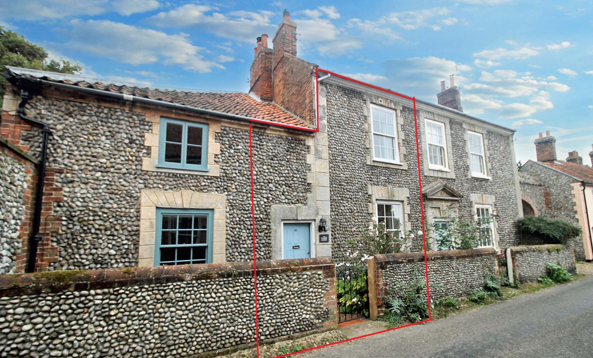
The Seaside House, Blakeney