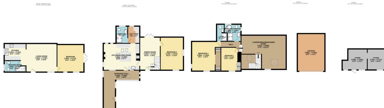
TOTAL FLOOR AREA : 266.4 sq.m. (2867 sq.ft.) approx. Whilst every attempt has been made to ensure the accuracy of the floorplan contained here, measurements of doors, windows, rooms and any other items are approximate and no responsibility is taken for any error, omission or mis-statement. This plan is for illustrative purposes only and should be used as such by any prospective purchaser. The services, systems and appliances shown have not been tested and no guarantee as to their operability or efficiency can be given. Made with Metropix ©2025