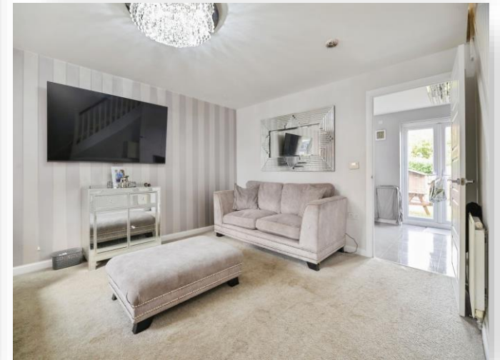
Bourneville Drive, Stockton-On-Tees TS19 8LD