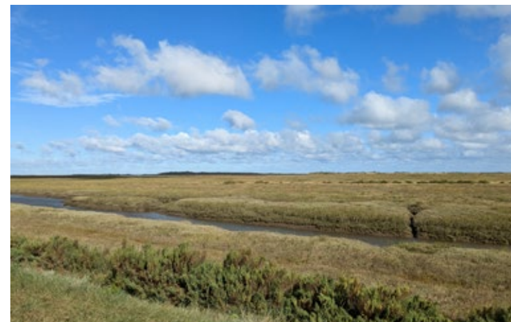
Burnham Overy Staithe

“ We love to walk up to Burnham Overy Staithe and then onto the Marsh and walk along the beach to Wells next the Sea, North Norfolk has the most stunning beaches.”